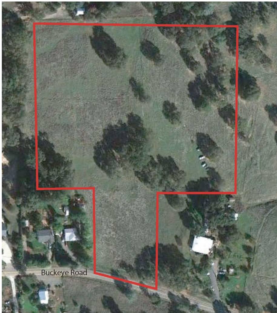
Figure 2 – Site Map (updated aerial photo from Google Maps)